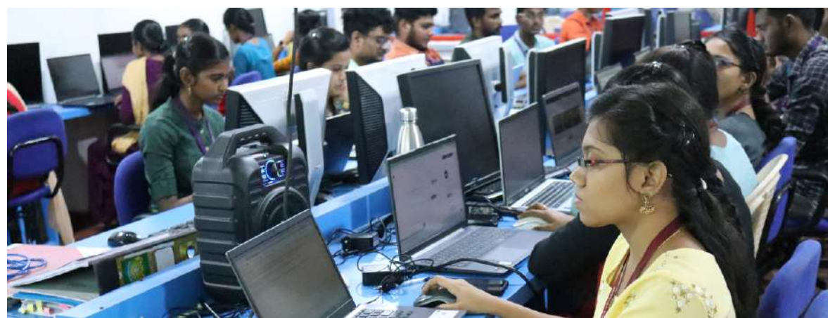
A section of the students at the 24-hour Hackathon