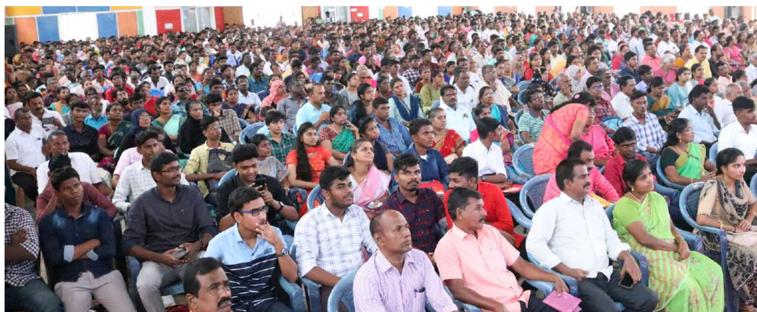
Parents and Students of the batch 2022-2026 at the freshers' Day Ceremony